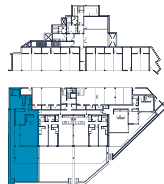
SITUACIÓN POR BLOQUE POSITION BY BUILDING